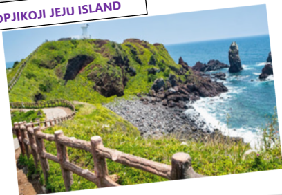
SEOPJIKOJI JEJU ISLAND